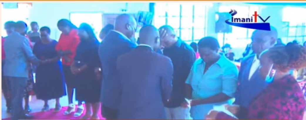
[Leaders getting annointed before commissioning]

Church leadership is about serving others in following Christ's footsteps so that they can see and accomplish God's purpose for themselves in the world.