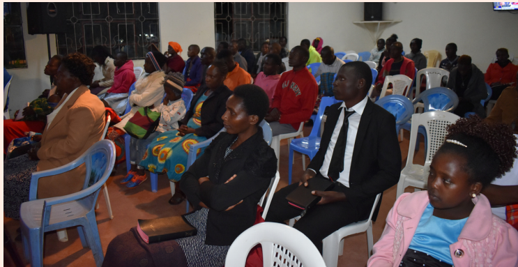
[congregants listening keenly]