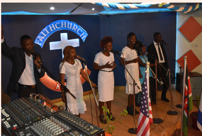
[Imani Praise Team leading the worship]

Imani media ministries together with the faith Interdenominational Church (FIC) held this month's Kesha on 8th July, 2022 .The turnout was amazing with over 100 people attending.