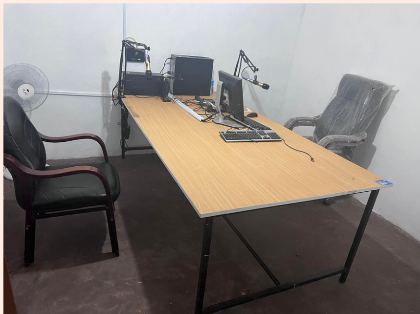
[Complete studio set up in TANA RIVER]