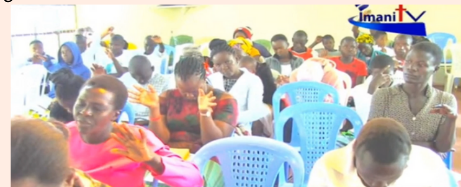
[Congregants joining in faith for dedication]