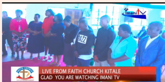
[Leaders from different church department]