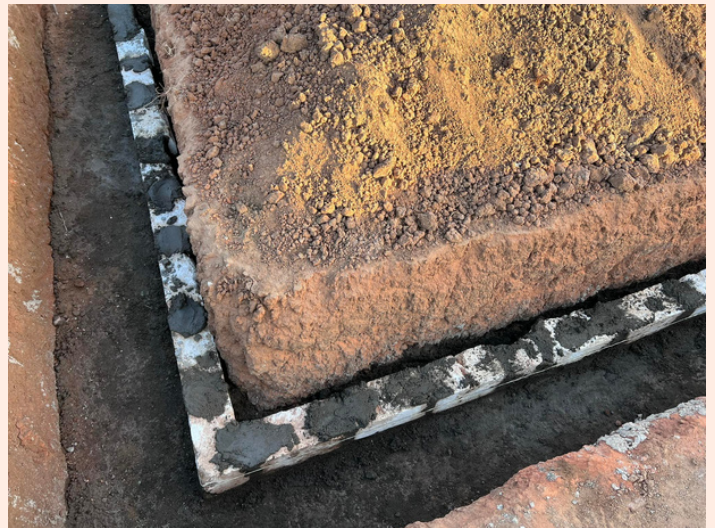
[The construction of the foundation]