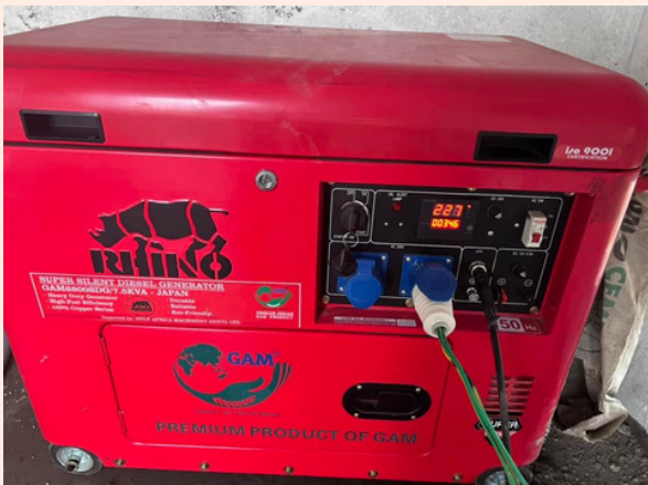
[The Generator Keeping us on air]