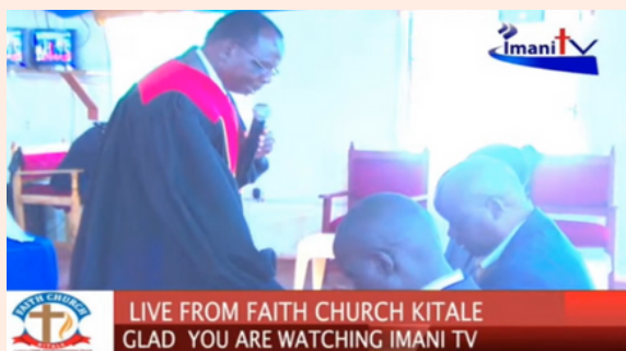
[Dedication of pastors]

(1st peter 10:11 Each of you should use whatever gift you have received to serve others, as faithful stewards of God's grace in its various forms. If anyone speaks, they should do so as one who speaks the very words of God. If anyone serves, they should do so with the strength God provides, so that in all things God may be praised through Jesus Christ. To him be the glory and the power for ever and ever. Amen.)