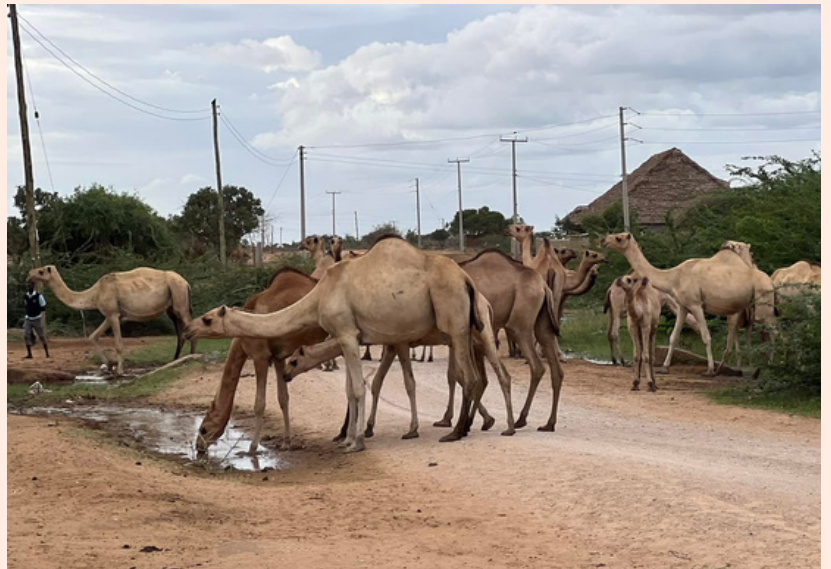
[Arrival to the locality]