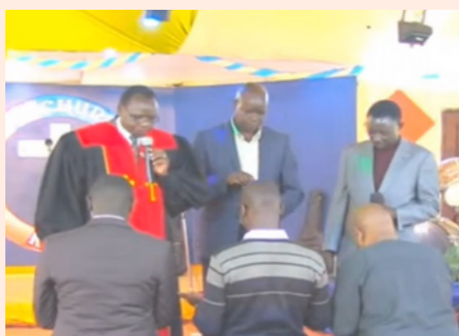
[Dedication of Deacons]