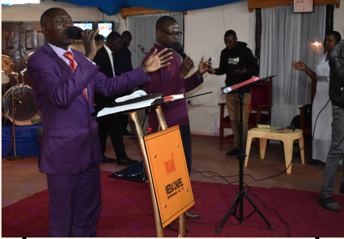
[Congregants led in worship]