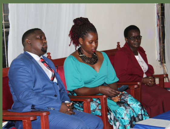
[Guests Listening keenly]