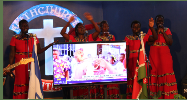
[Neema Choir praising God]