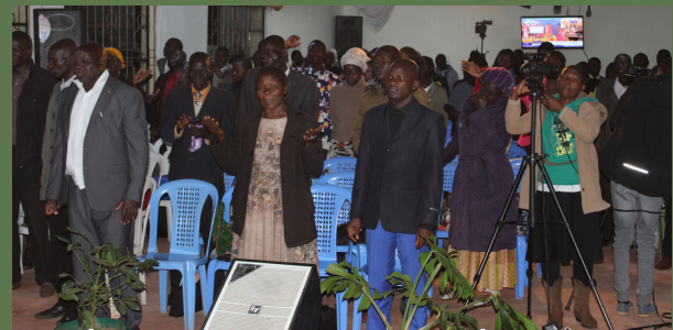
[Congregants Praising God]